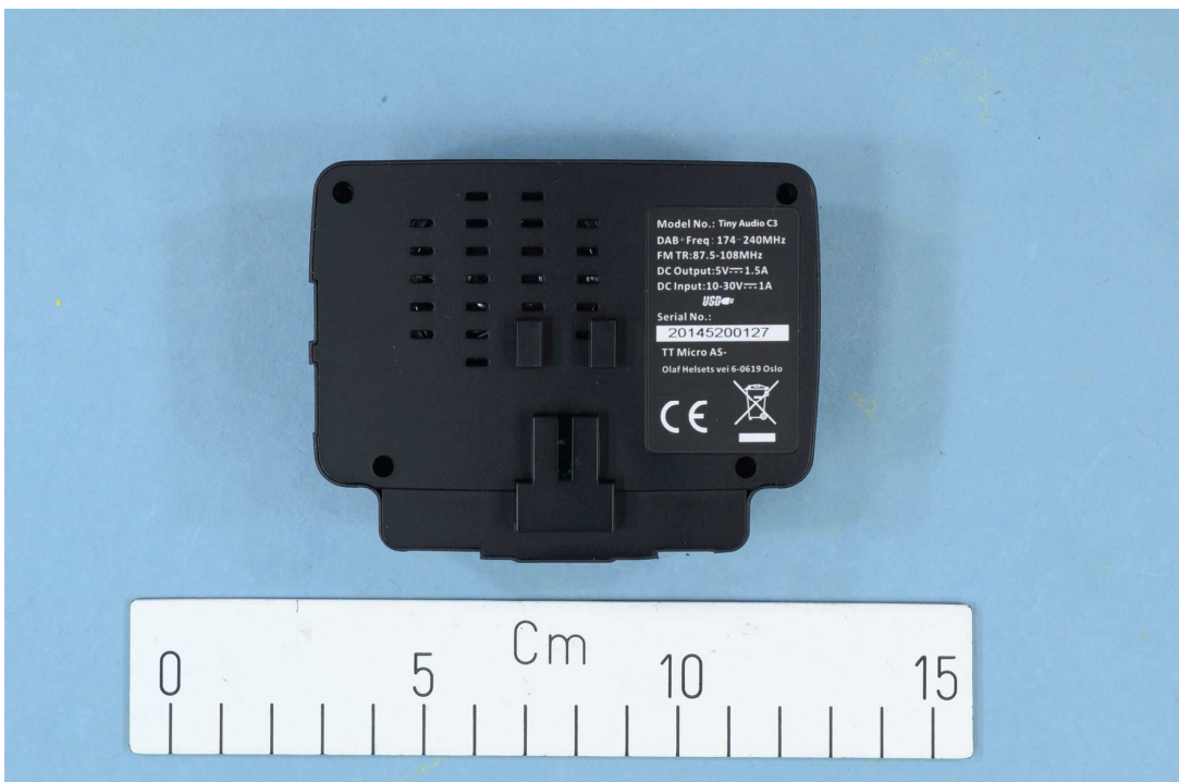
Tiny Audio C3