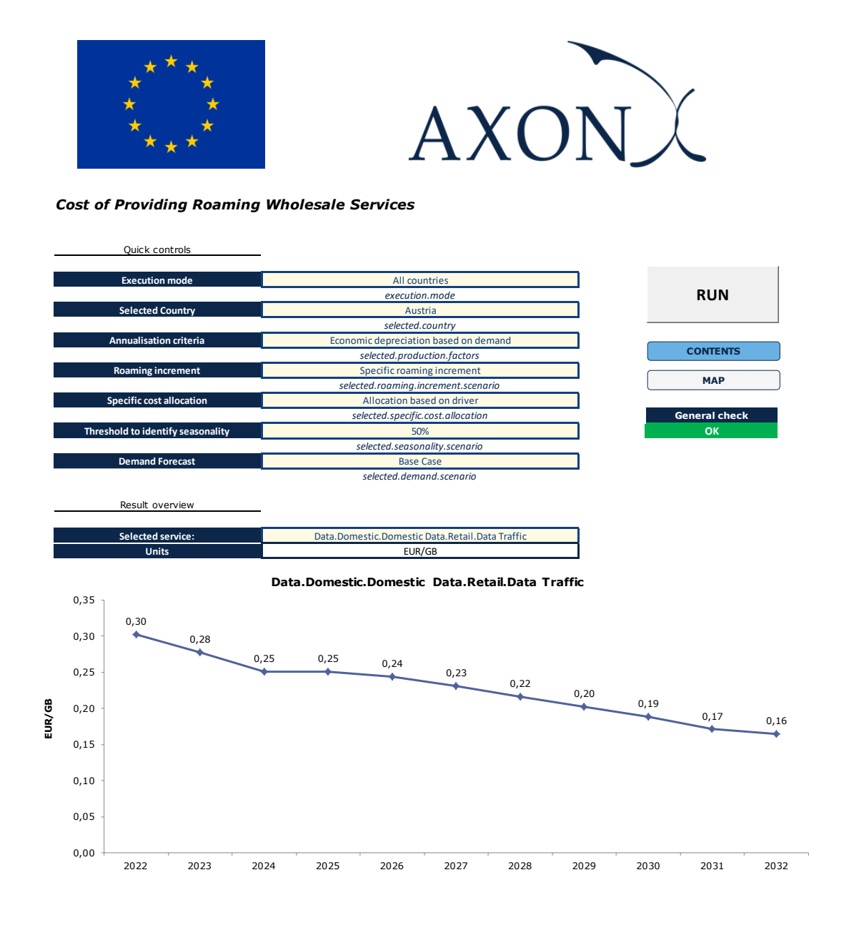
Exhibit 4.1: Snapshot of the control panel

The control panel (or COVER) represents the main interface of the model to the user. This worksheet is used to select the model's main available options, configure the execution mode and run the model. The following figure shows a snapshot of the control panel.